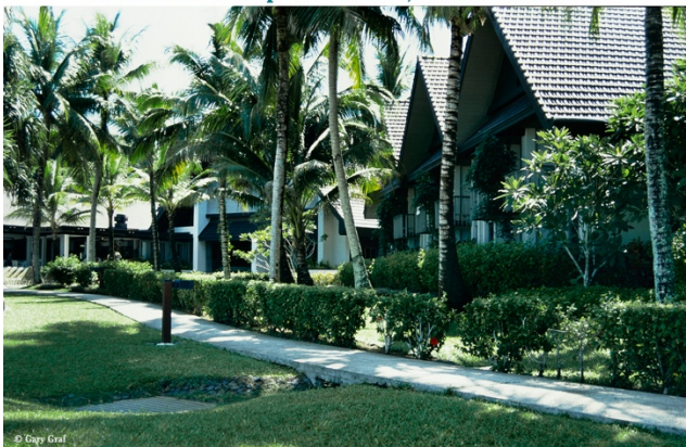
Out front, Palau Pacific Resort