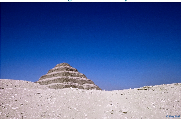
The Step Pyramid of Djoser, ruins of Memphis