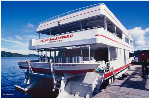
Palau Aggressor II and Palau Aggressor II 1/2