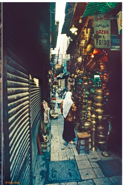
bAZARs are ubiquitous in Cairo