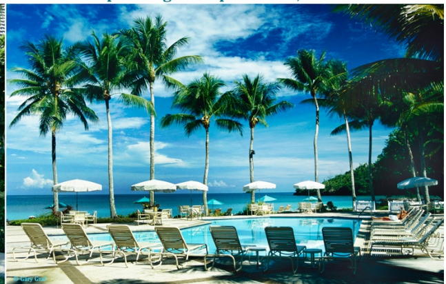
Out back, Palau Pacific Resort