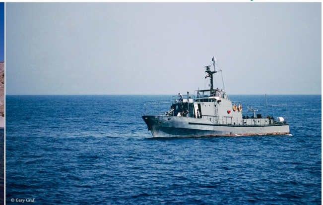
Egyptian Navy patrol boat checking passports