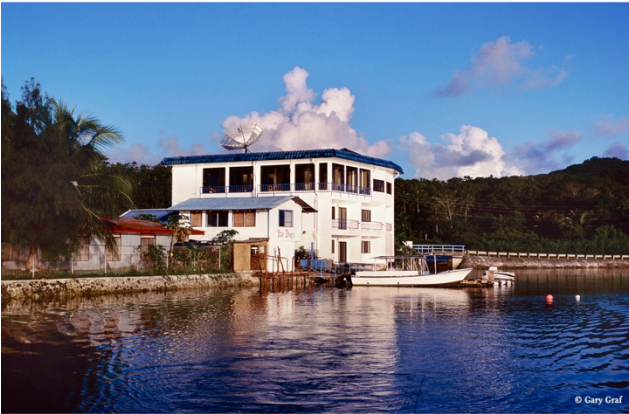
Manta Ray Bay Resort and Yap Divers shop