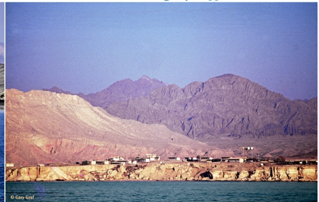
Sorta looks like this could be a military base