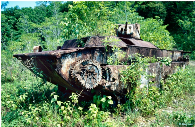
World War II Japanese tank, Peleliu war zone