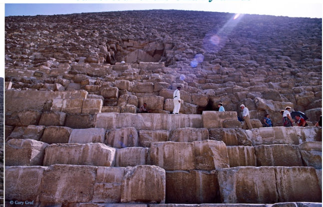
Tourists entering Great Pyramid