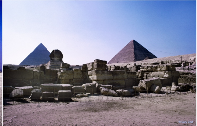
Three Giza landmarks