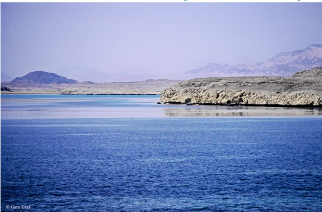
Some of the Sinai Peninsula abutting the Red Sea