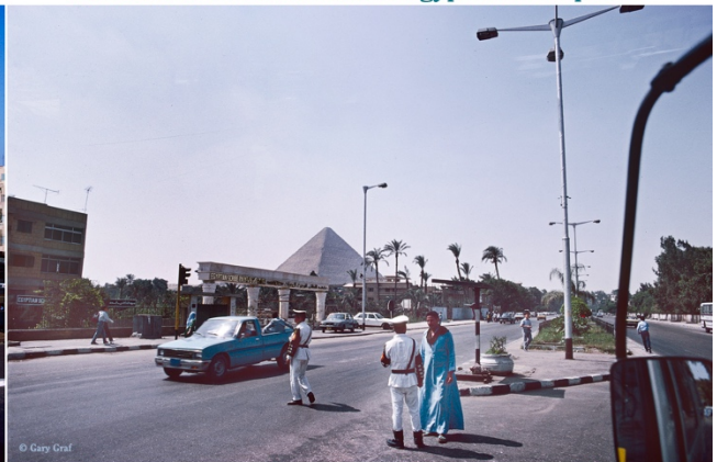
The Giza Pyramids aren't all that far out of town