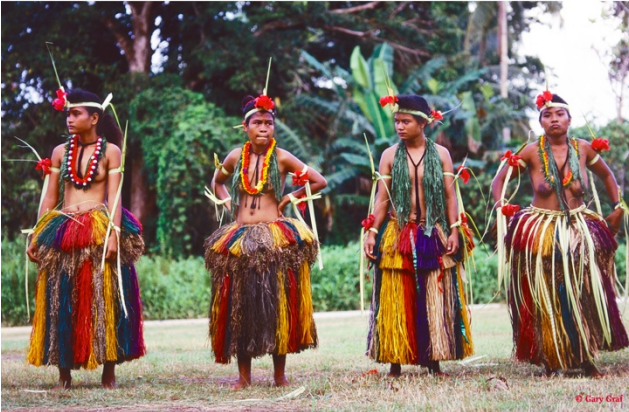
Yapese traditional dancers scoping audience