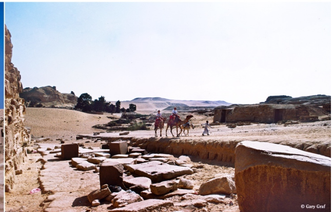
Camel tour of the Giza Pyramids