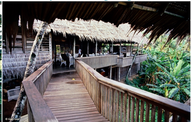
Dining area at the Village Hotel