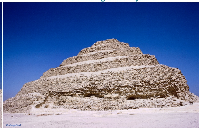
Closer view of the Step Pyramid, only 4,700 years old