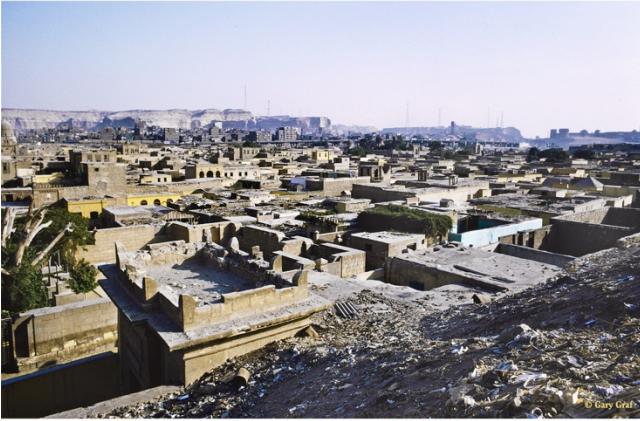
Cairo's City of the Dead, populated by squatters