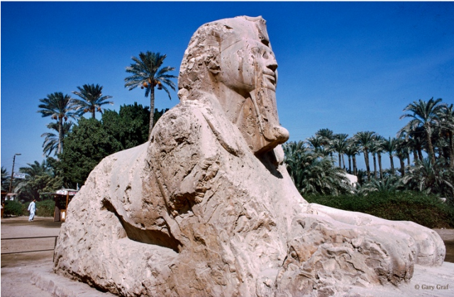
Unidentified statue on the streets of Cairo