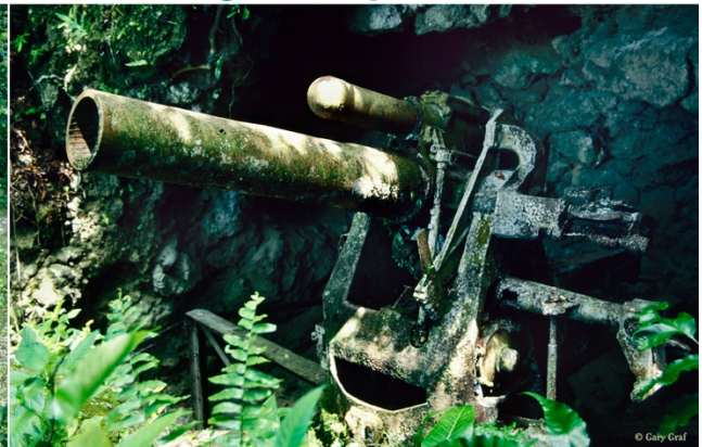
Japanese gun emplacement, Peleliu