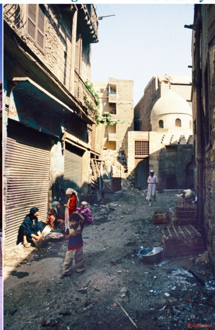
Downmarket back alley, Cairo