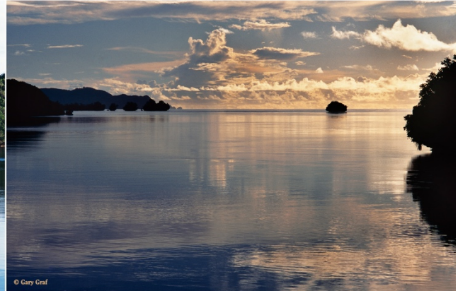
Among the coral uprisings at sunset