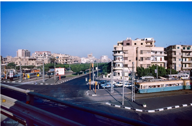
Some of Cairo's multiplying apartment buildings