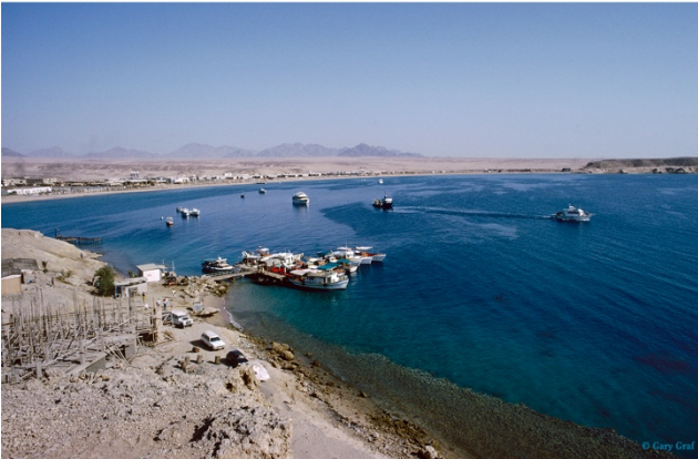
A few of the dive boats homeported in Na'ama Bay