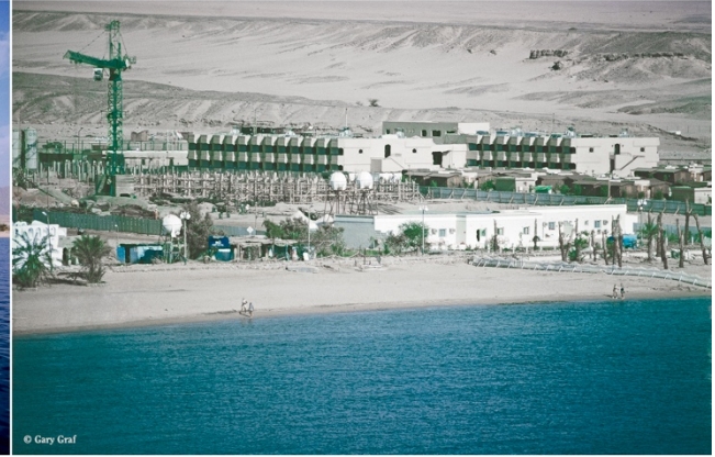
Construction would go on 24/7 in Sharm