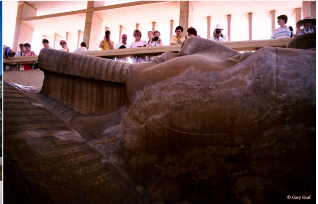
Just inside the Museum of Egyptian Antiquities