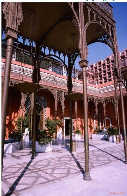
Upmarket Marriott Hotel, Cairo