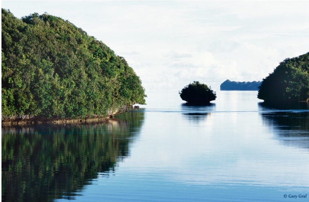
Coral uprisings known as the Rock Islands, Koror