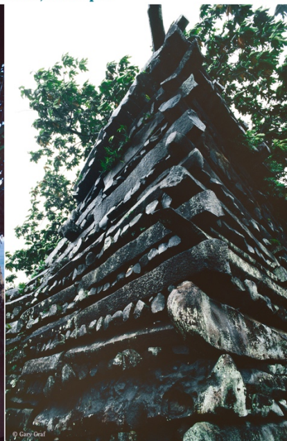
Nan Madol ruins, Pohnpei