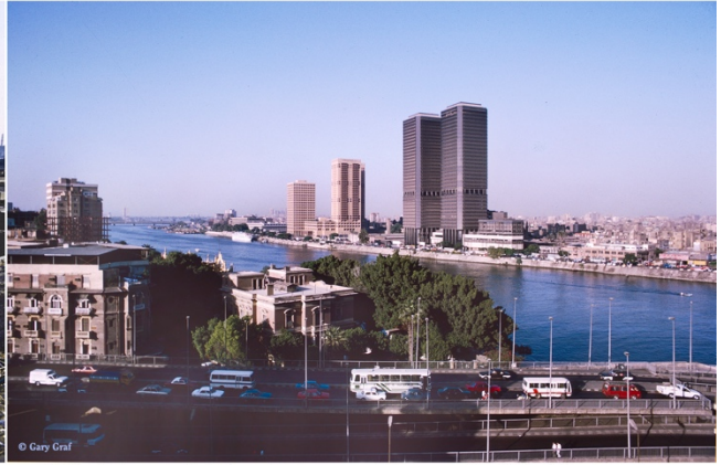
Nile River divides Cairo on its way to Mediterranean