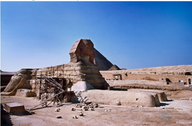
The Sphinx under repair, next to Giza Pyramids