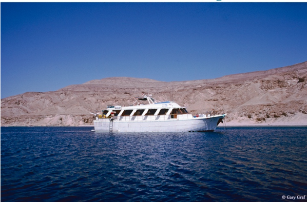
Ghazala I liveaboard at anchor, Red Sea