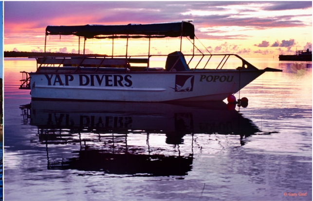
The sun sets behind Popou , the Yap Divers boat