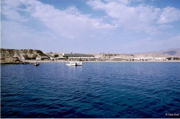
Na'ama Bay, Sharm el-Sheikh