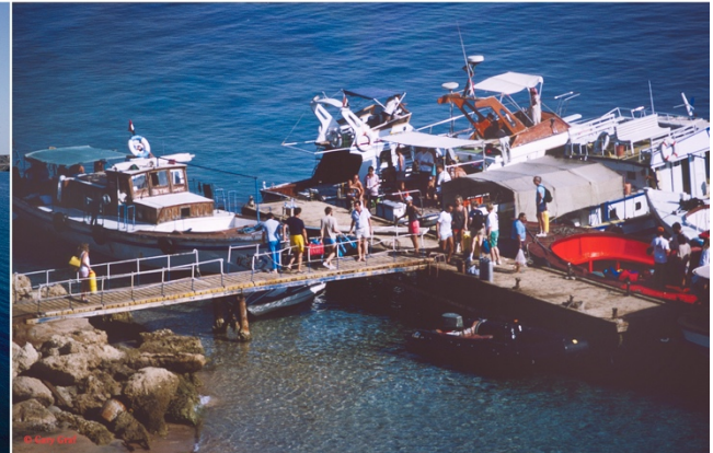
Divers boarding day-trippers