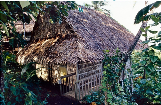
My accommodation at the Village Hotel, Pohnpei