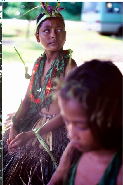
Younger Yapese dancers