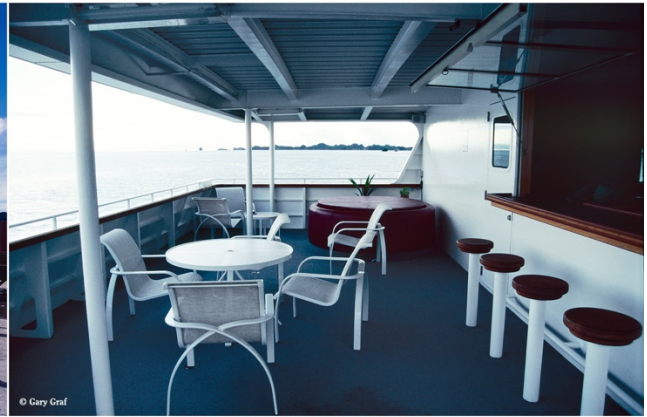
Palau Aggressor II upper deck lounge and wet bar