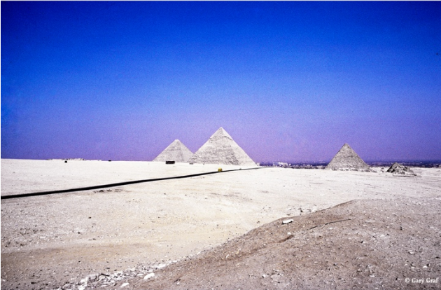
The big three: the Pyramids of Giza, Cairo outskirts