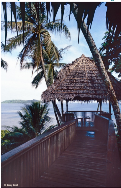
Village Hotel gazebo