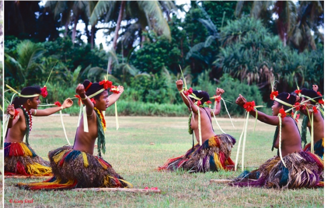
Yap dancers dancing sitting down